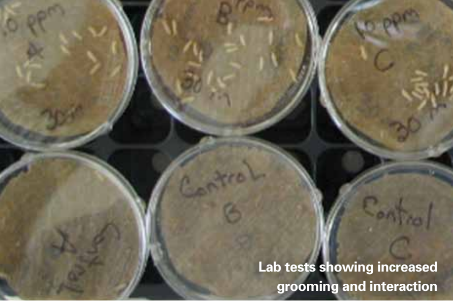
Lab tests showing increased grooming and interaction